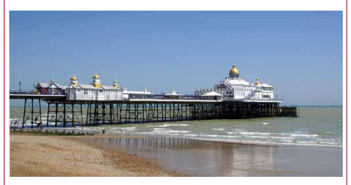
Figure 1: Seaside towns possess unique assets, such as Eastbourne's pier, which can be central to their regeneration