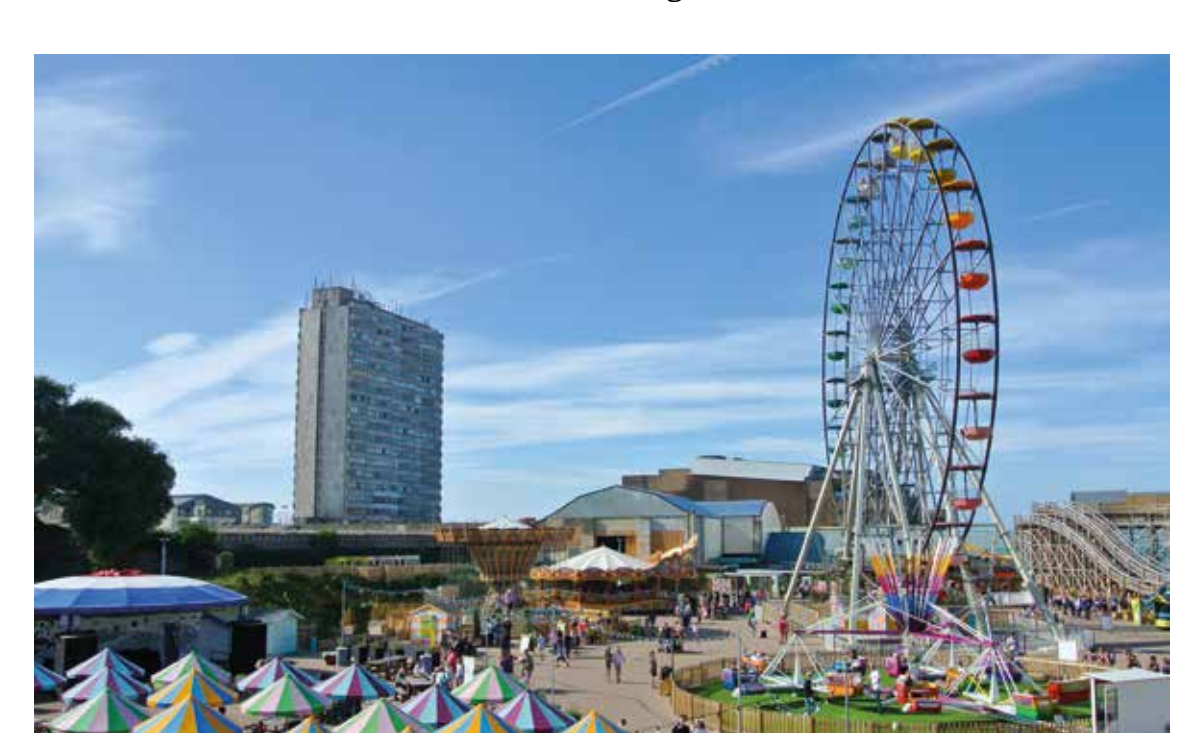
Figure 3: Dreamland in Margate is an example of a successful council-led regeneration initiative