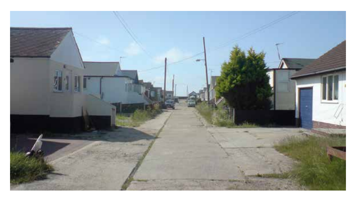
Figure 2: Jaywick faces various challenges related to poverty, health, and infrastructure