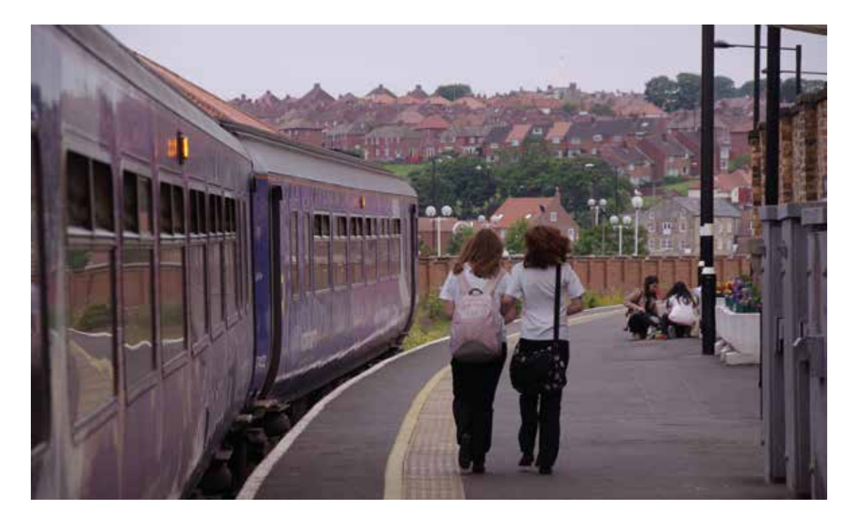
Figure 5: Coastal towns in rural areas, such as Whitby, often suffer from infrequent rail services

113. During our visits, we were encouraged by the many examples of successful transformation that we encountered. However, we heard repeatedly that despite the drive and ambition that is clearly present, areas are suffering from poor transport links which are severely hindering the opportunities for bringing about sustainable improvements, either to the visitor economy, or for attracting inward investment. Poor connectivity is central to the problems faced by many coastal areas.