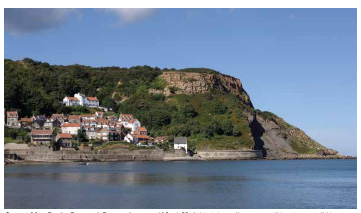
Figure 6: Local residents and businesses have contributed to funding Runswick Bay's coastal defences