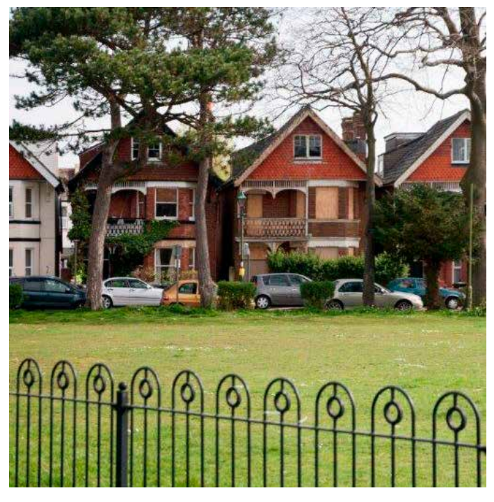
What is 'good growth'? And how is it achieved? Our case studies of Falmouth, Cornwall and Boscombe, Bournemouth suggest the approach is changing over time. Images: Left: Church Street Falmouth. Right: Churchill Gardens, Boscombe.