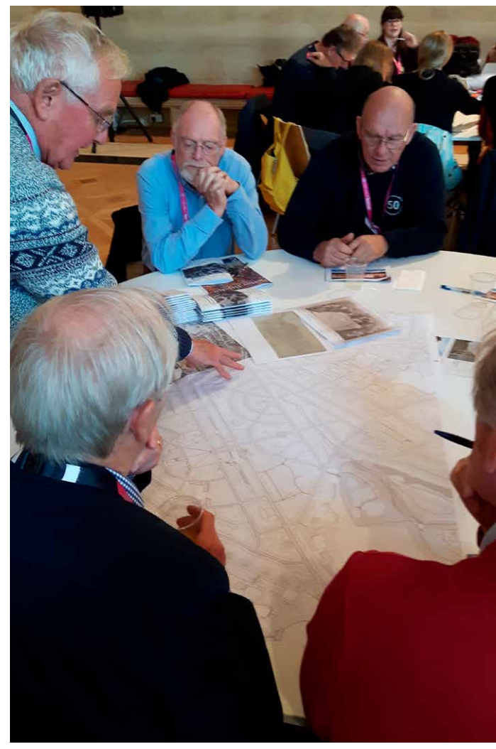
Image: Delegates at the Bristol Heritage Forum 'Conservation Areas at 50' conference.