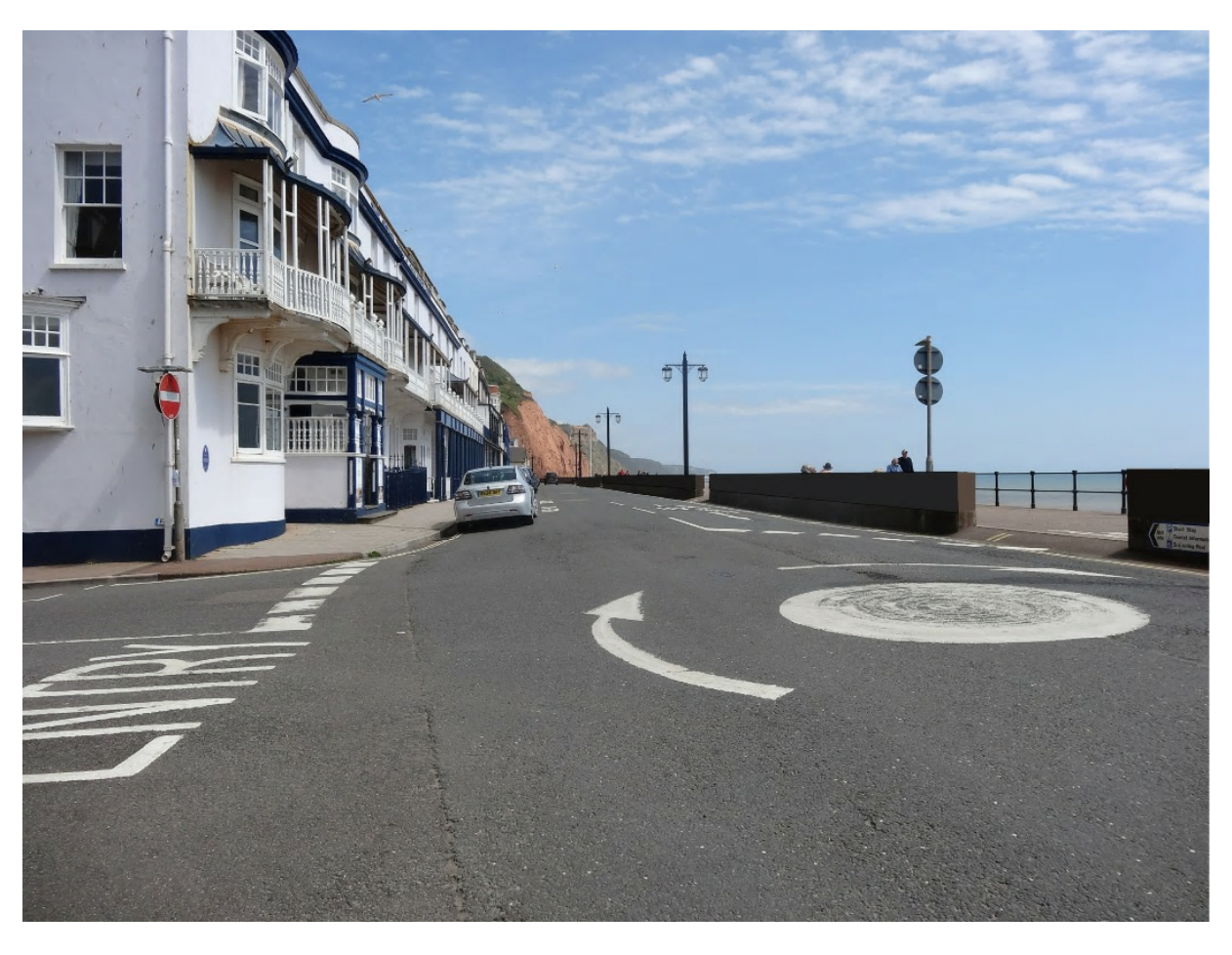
50 cm above existing wall height