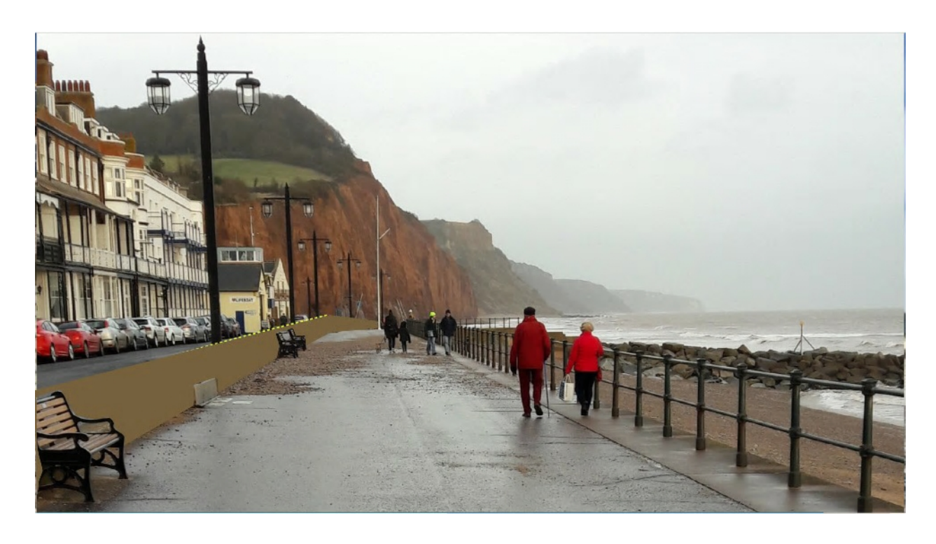
50 cm above existing wall height