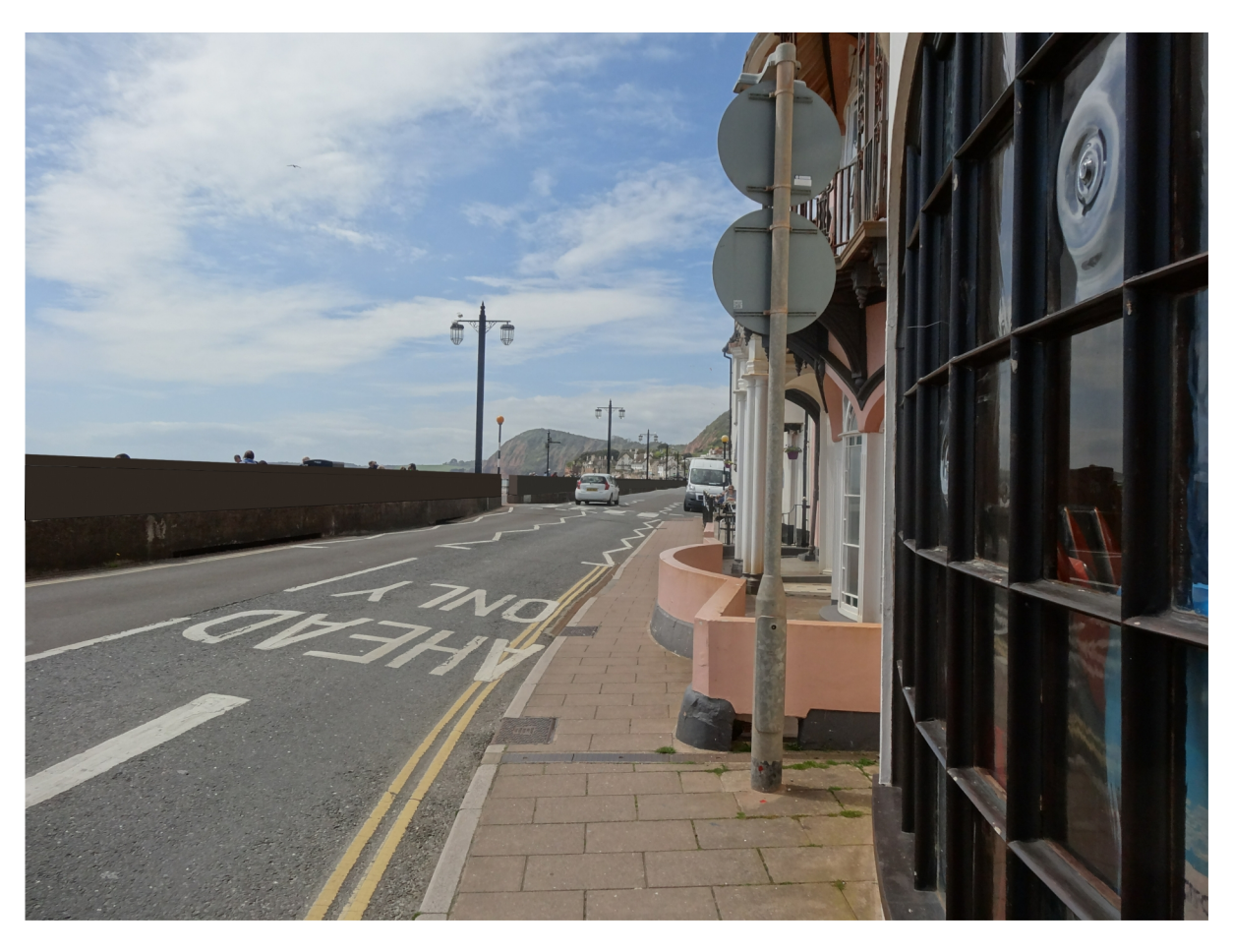
New height of 66 cm above existing