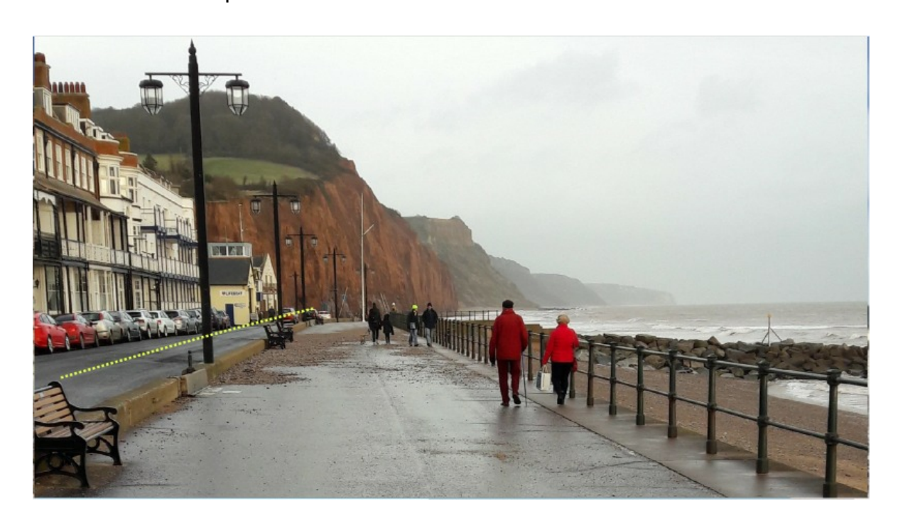
RHDHV image from the BMP exhibition. 2018

The effects may be greater than shown as the current wall height varies. If it is intended to have the wall measured from the Esplanade pavement to a set height then some places will show more than a 66 cm increase.