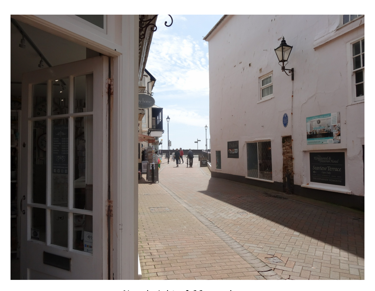
New height of 66 cm above