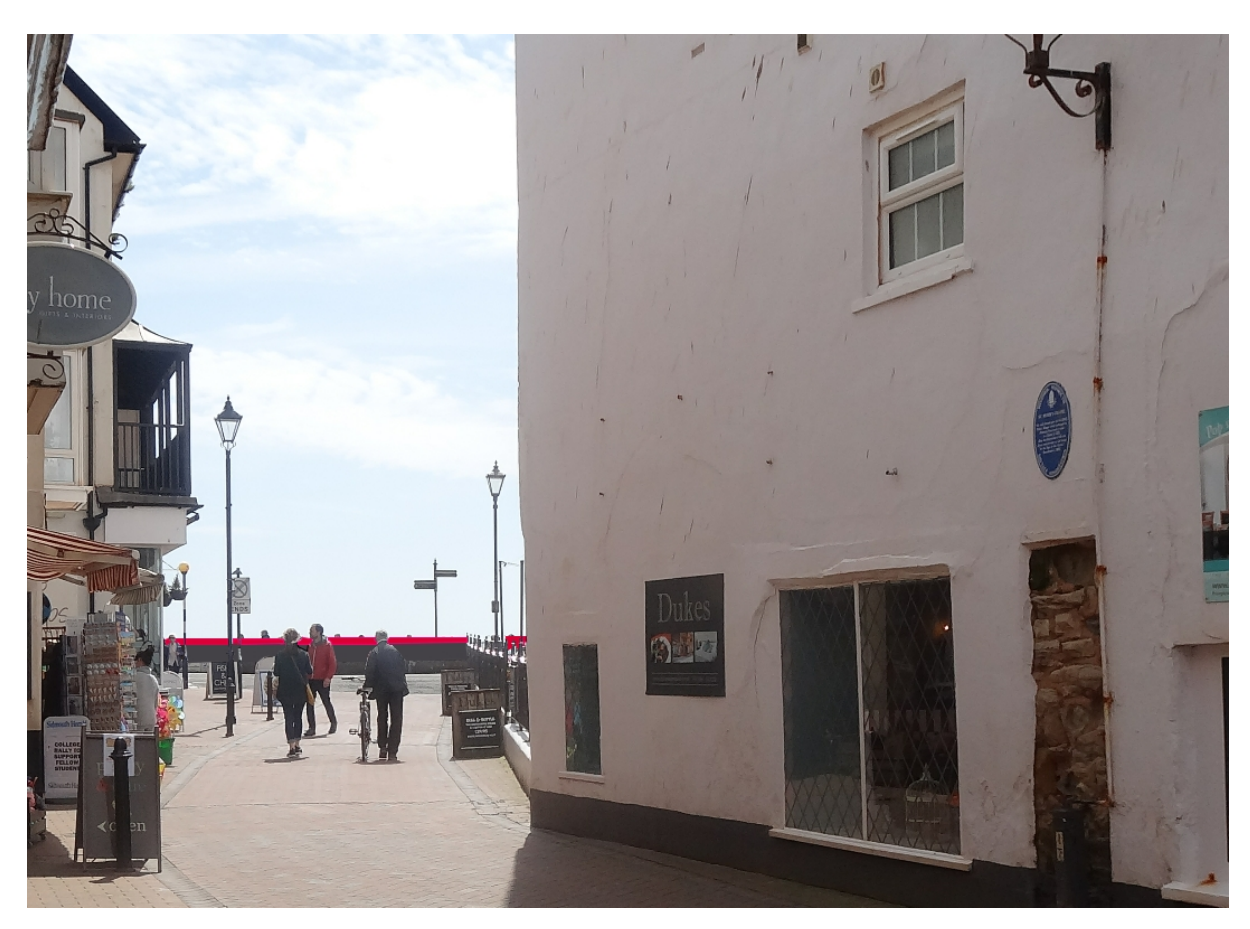
Increase in height