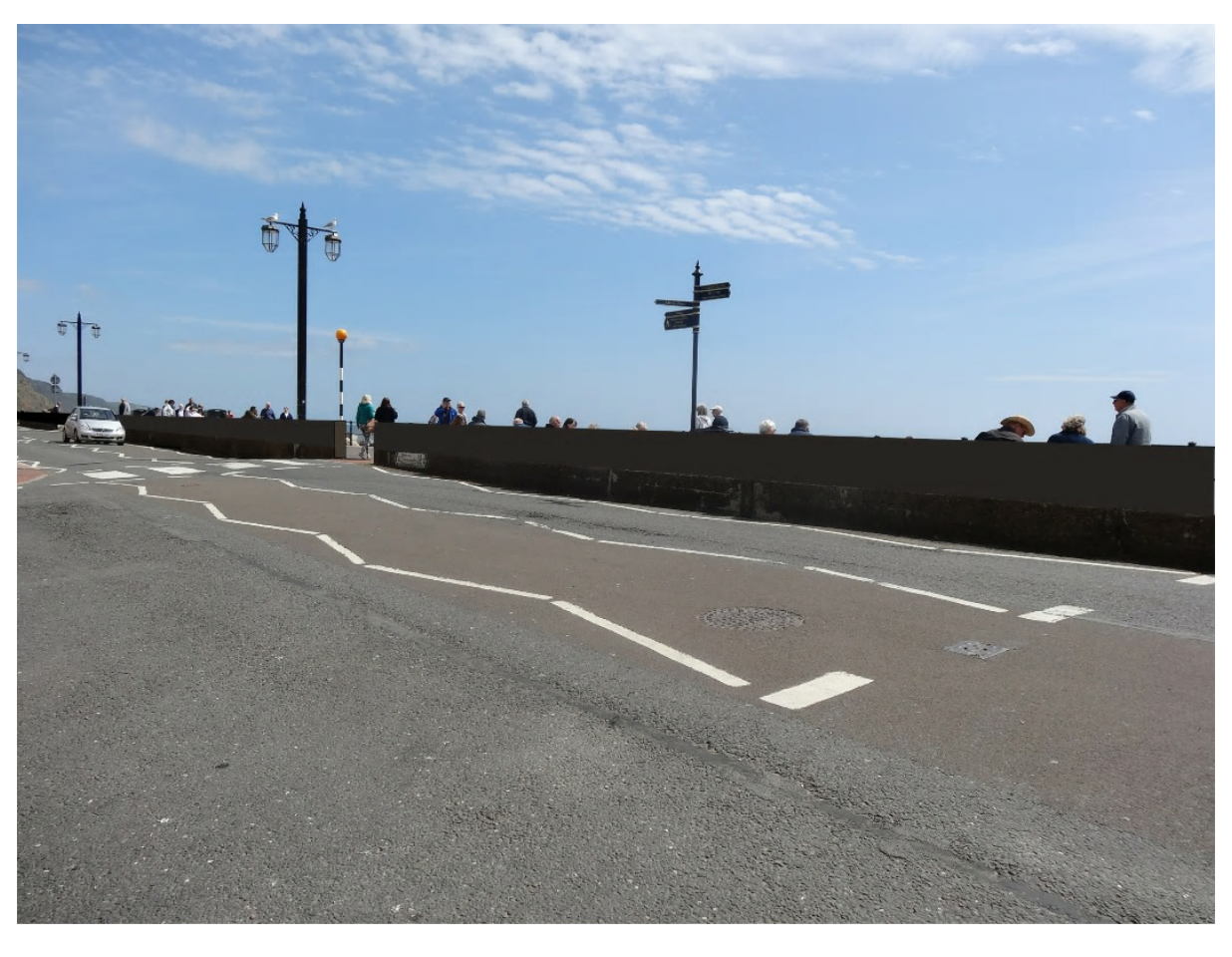
50 cm above existing wall height