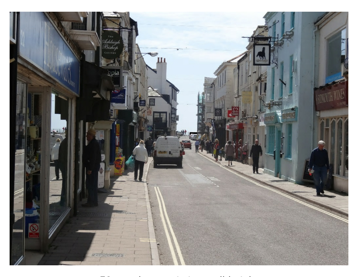
50 cm above existing wall height