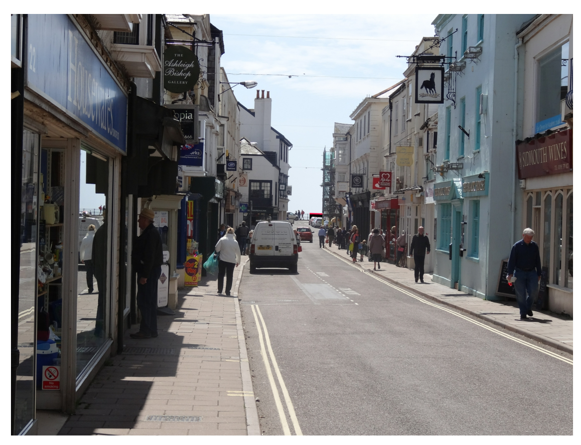
Increase in height