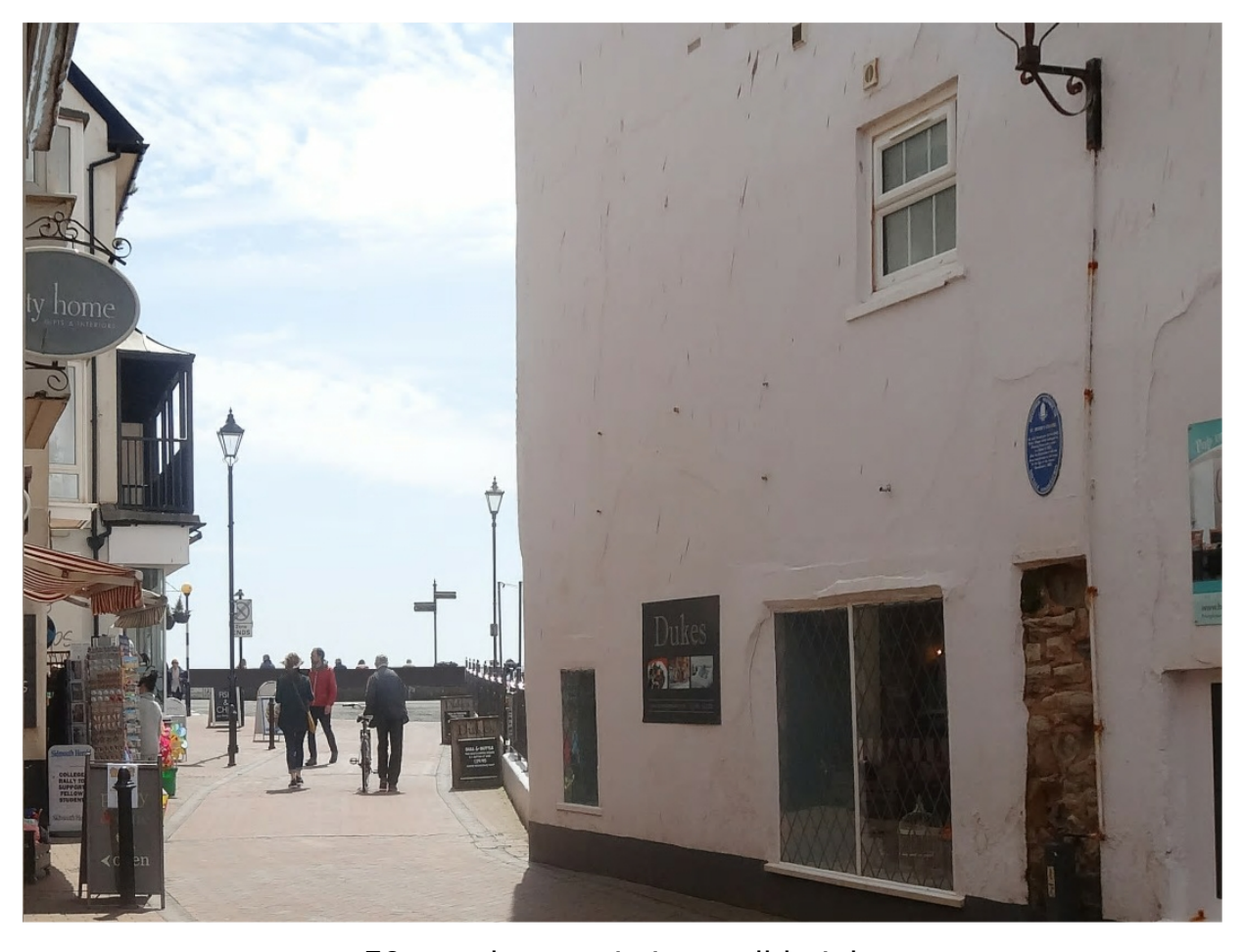
50 cm above existing wall height