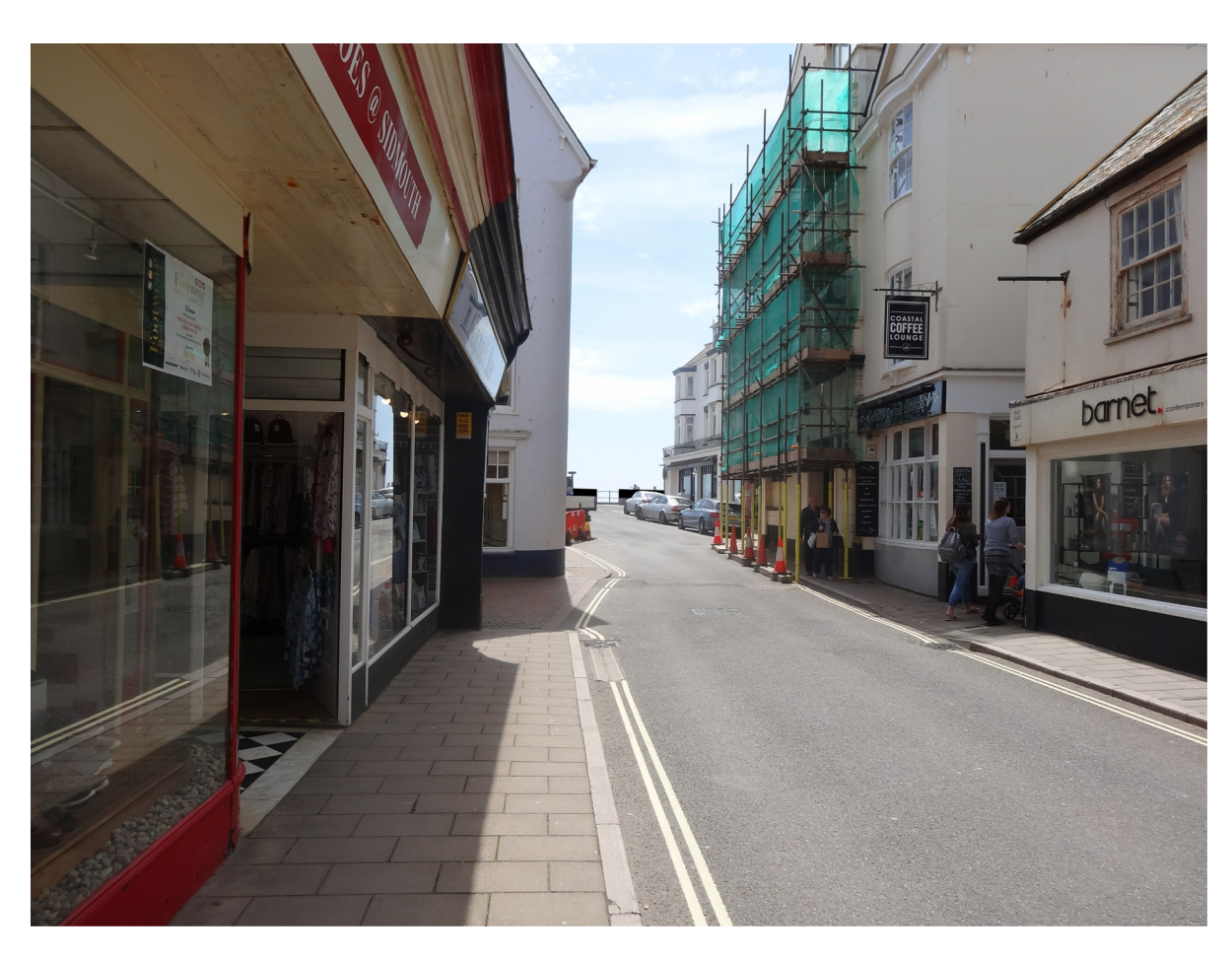
New height of 66 cm above existing