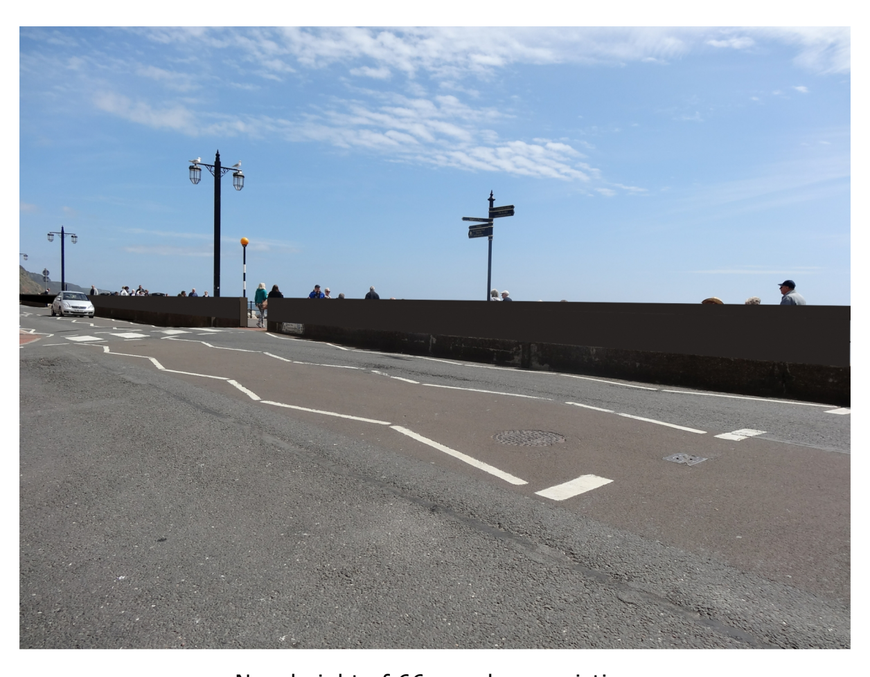
New height of 66 cm above existing