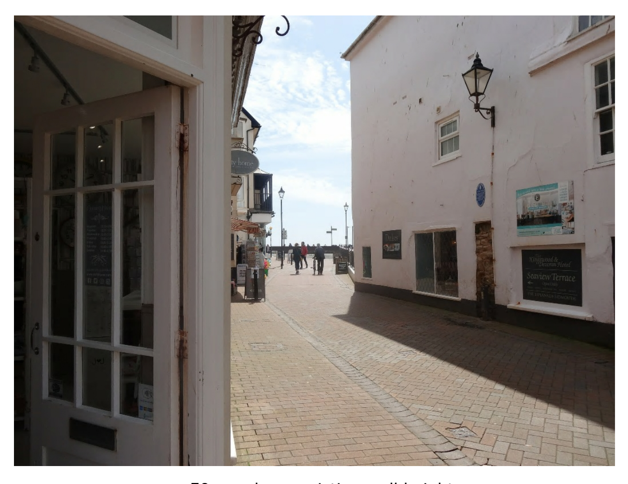
50 cm above existing wall height