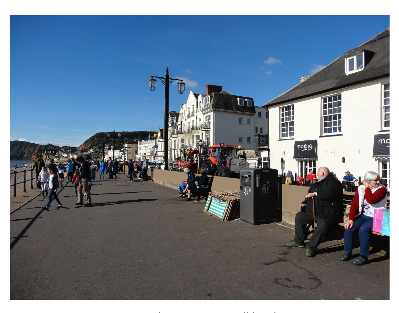
50 cm above existing wall height