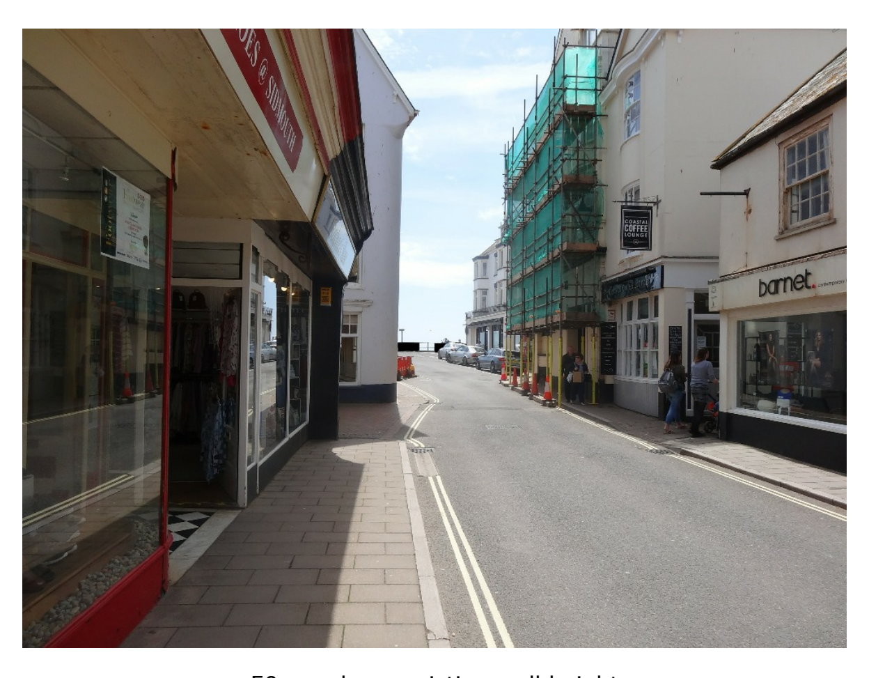
50 cm above existing wall height