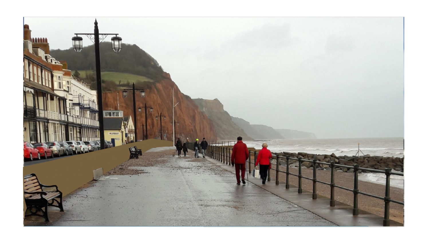
New height of 66 cm above existing.