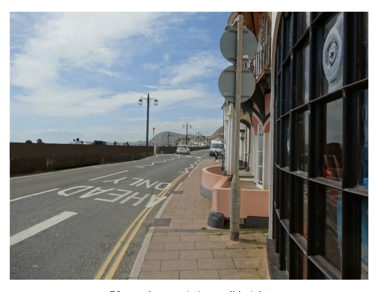
50 cm above existing wall height