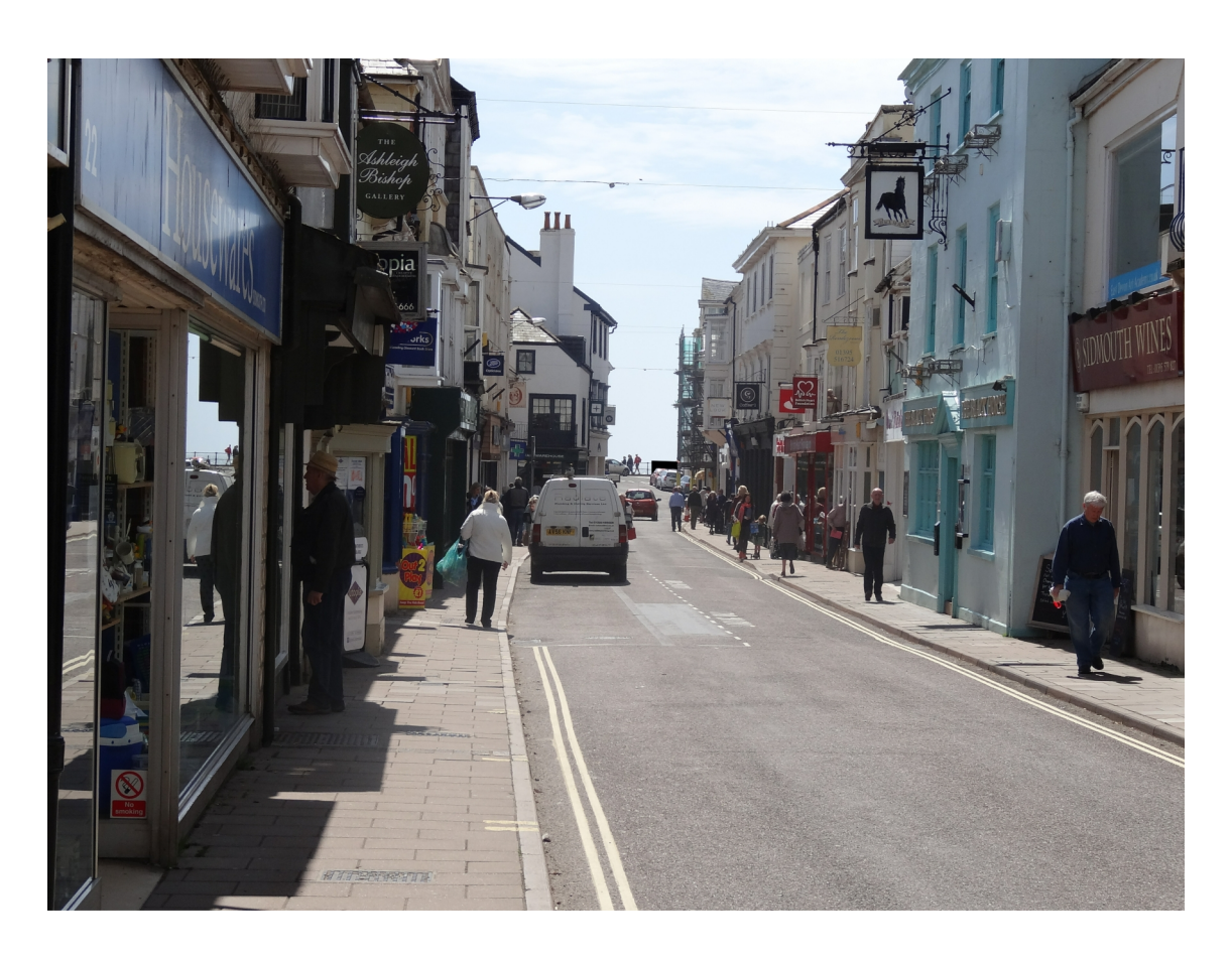
New height of 66 cm above existing