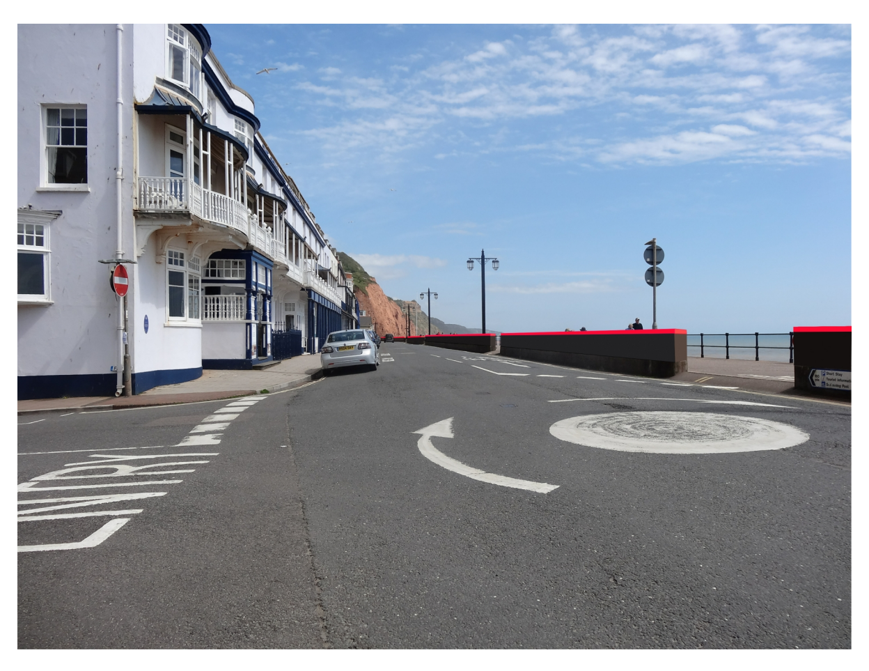
Increase in height