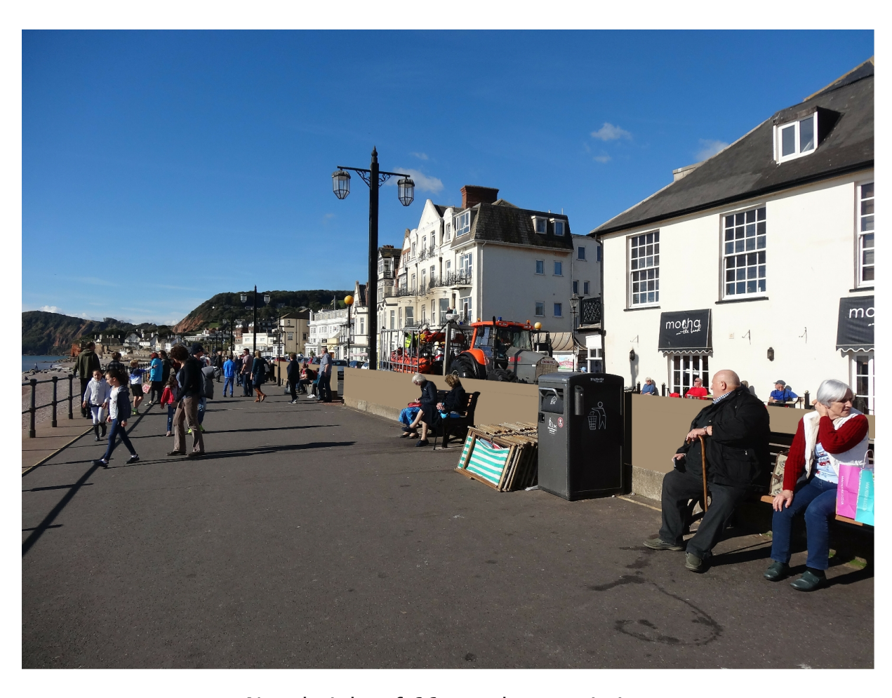
New height of 66 cm above existing