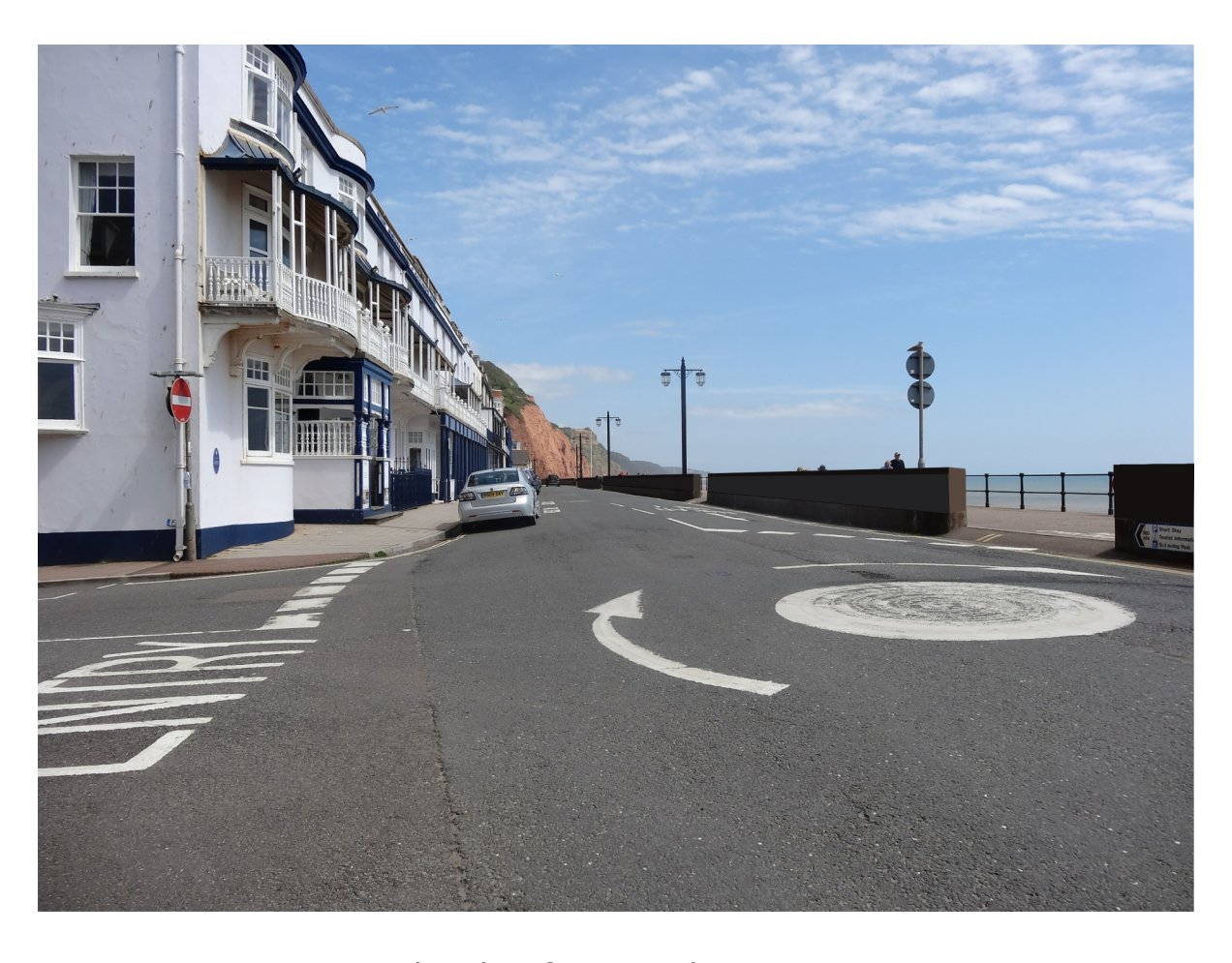
New height of 66 cm above existing