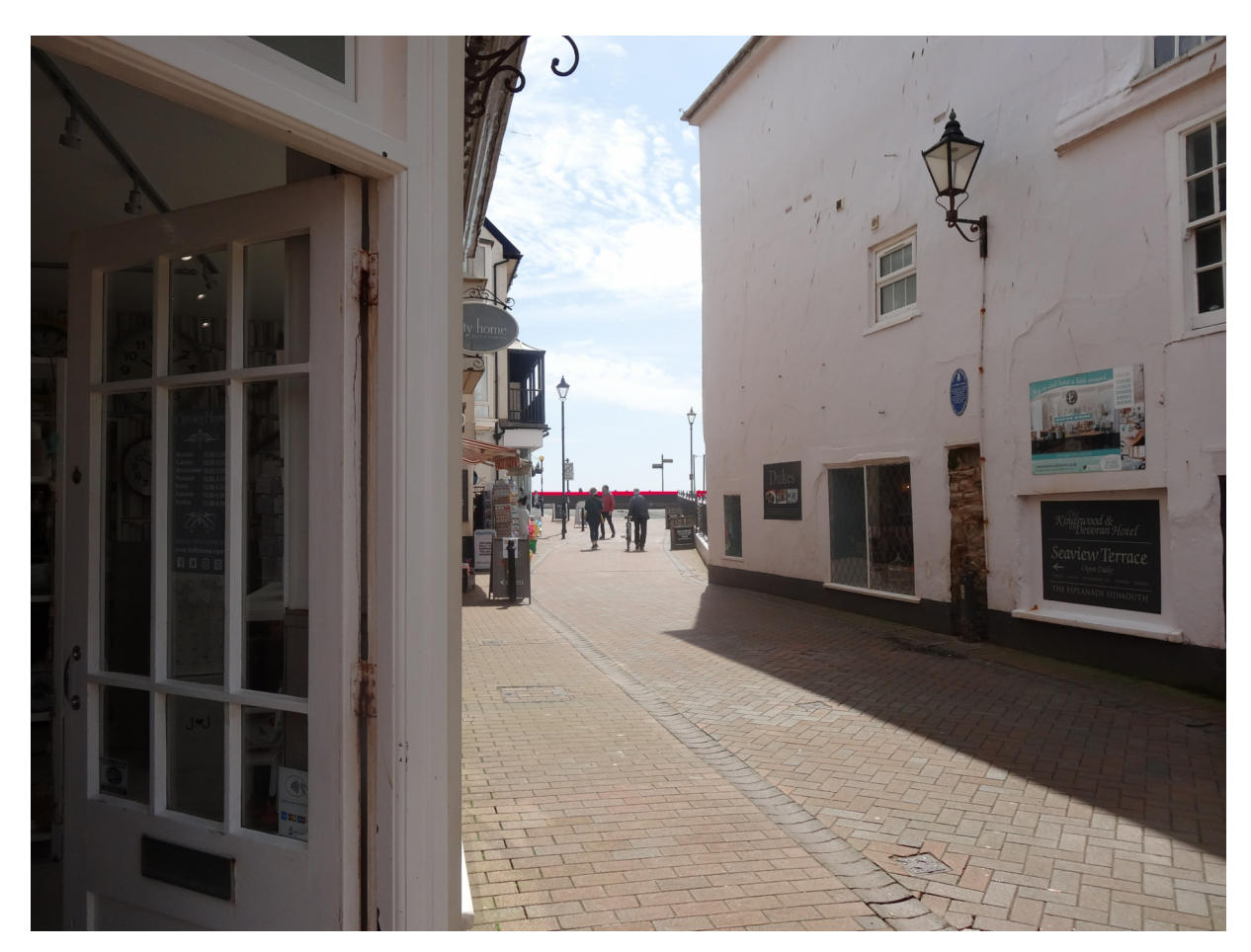
Increase in height