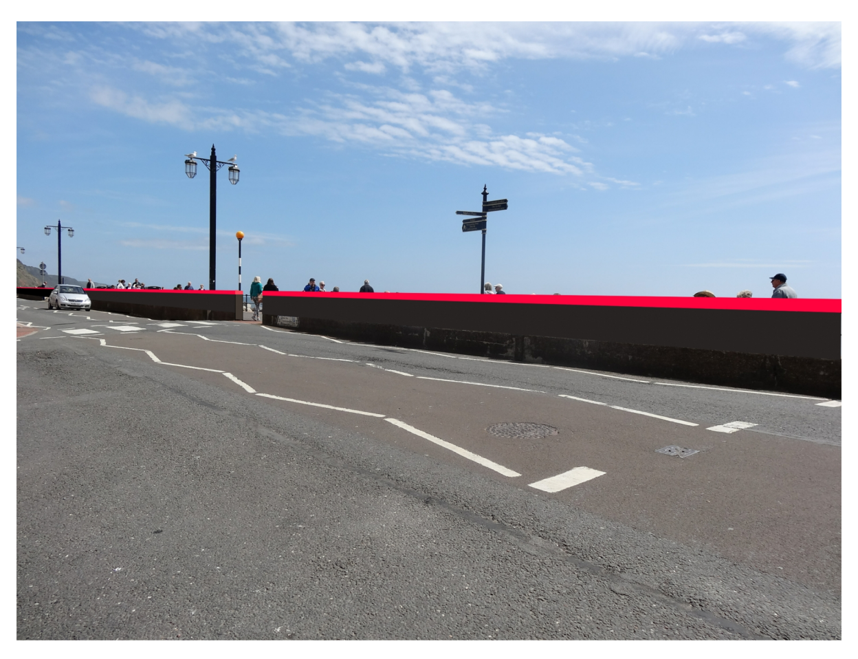
Increase in height