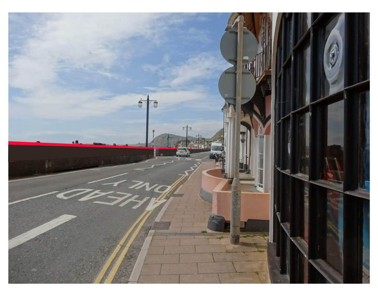
Increase in height