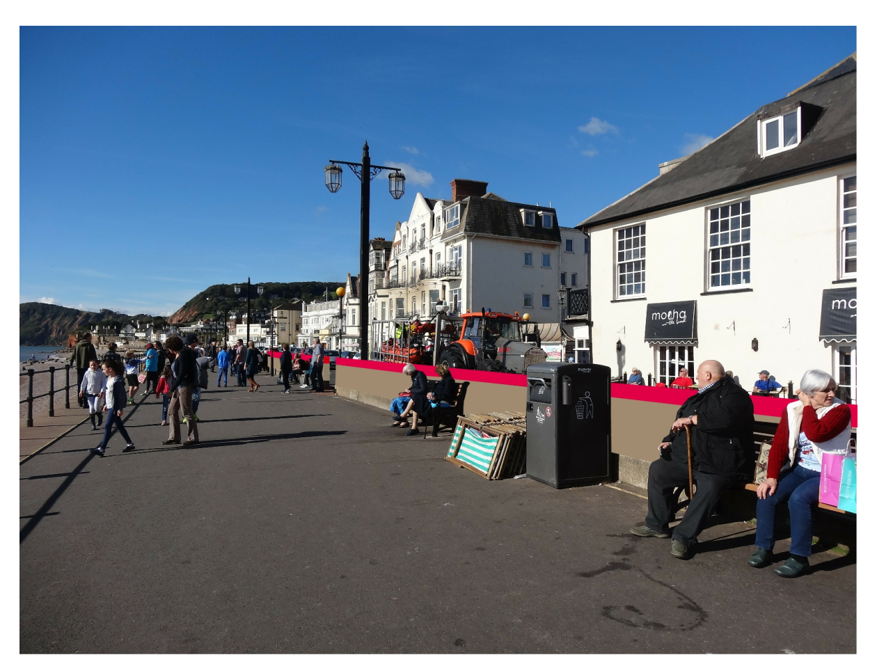
Increase in height