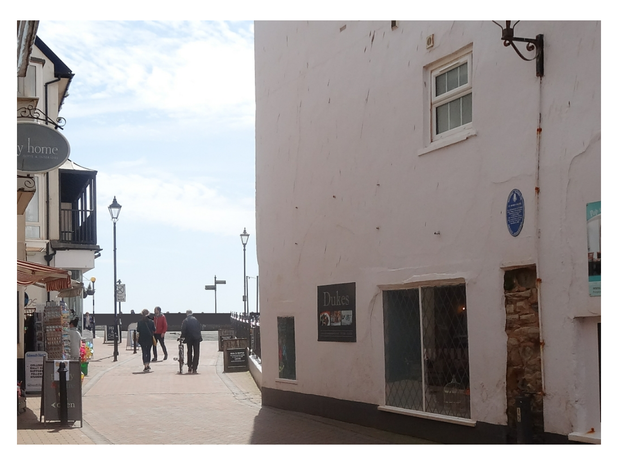
New height of 66 cm above existing